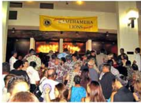
Annual "Laughs For Lions" Fundraiser

To encourage service-minded men and women to serve their community without personal financial reward, and to encourage efficiency and promote high ethical standards in commerce, industry, professions, public works and private endeavors.