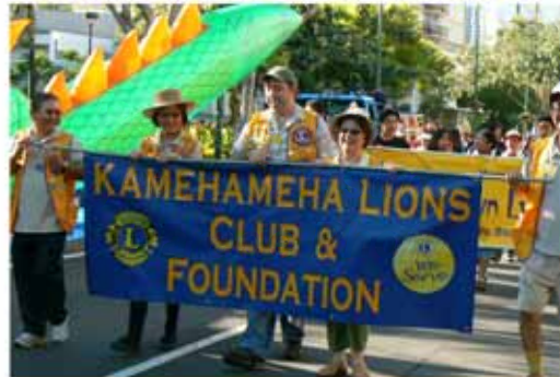
Annual Liliha-Palama Christmas Parade